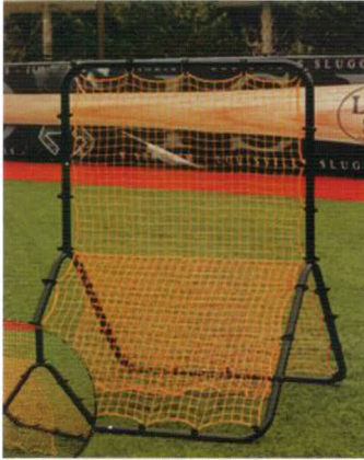
Model Number: SLVPROB

Thank you for purchasing a Louisville Slugger product. Our silver series offers high quality sports training equipment. Please visit our website at www.slugger.com or call 1-800-282-2287 with questions or to purchase accessories.